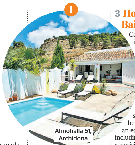
Almohalla 51, Archidona

It’s pretty much just you and the olive trees out here, plus a great view of the mountains from the small outdoor pool. It’s a short drive from Granada if you want to visit the Alhambra, but the owners have created quite the soporific escape so chances are you’ll want to stay put. The 15 rooms are spread throughout the 500-year-old cortijo; the best is in the former grain silo with a gorgeous wooden ceiling. Details B&B doubles cost from €119 (00 34 958 34 00 77, cortijodelmarques.com). Fly to Granada