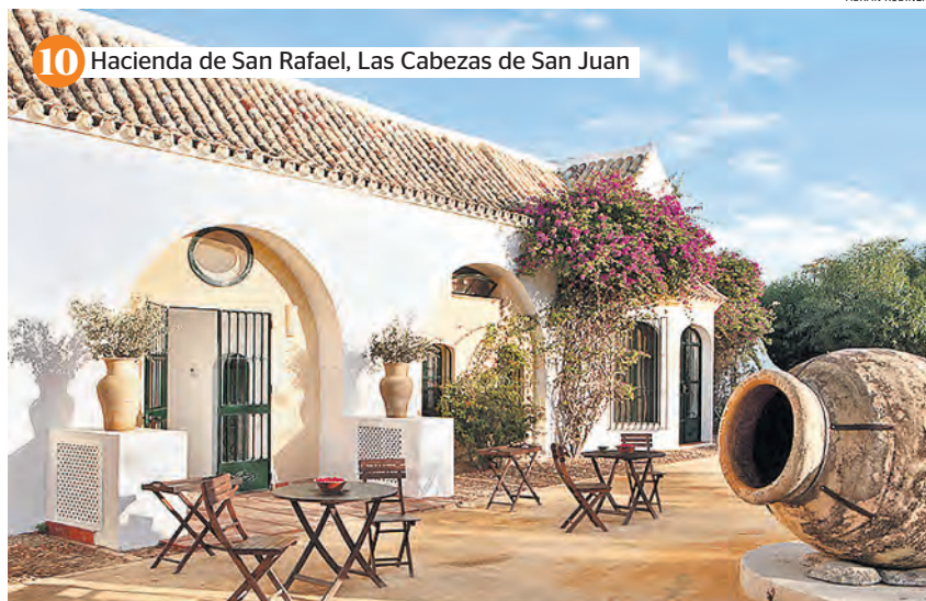
10 Hacienda de San Rafael, Las Cabezas de San Juan

building; those overlooking the courtyard are the most peaceful. Details B&B rooms cost from £120 (0330 1275743, mrandmrsmith.com). Fly to Jerez