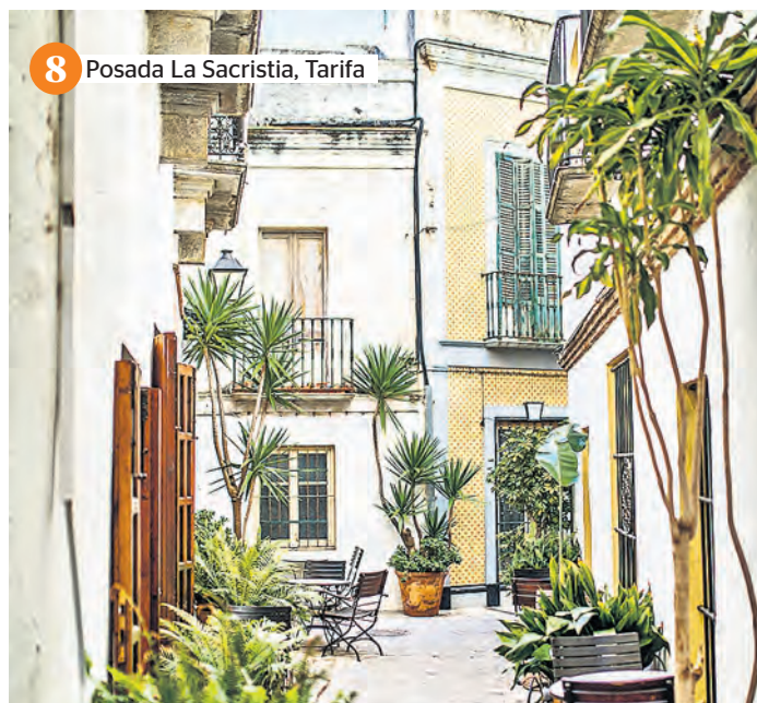
8 Posada La Sacristia, Tarifa