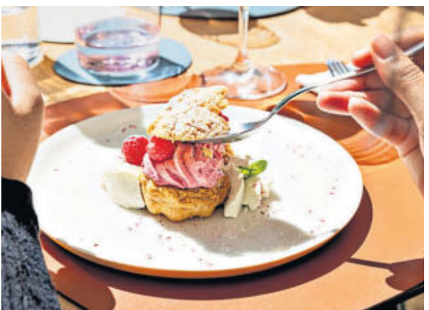
▲ Taste of culture: even the food at L'Arlatan, Arles, is a work of art ▲ Cool off in the 'swish' pool at Les Florêts

The village cottages of the Île de Ré lend themselves to a certain type of blue and white beach-breezy bolthole, and the island has a good selection to choose