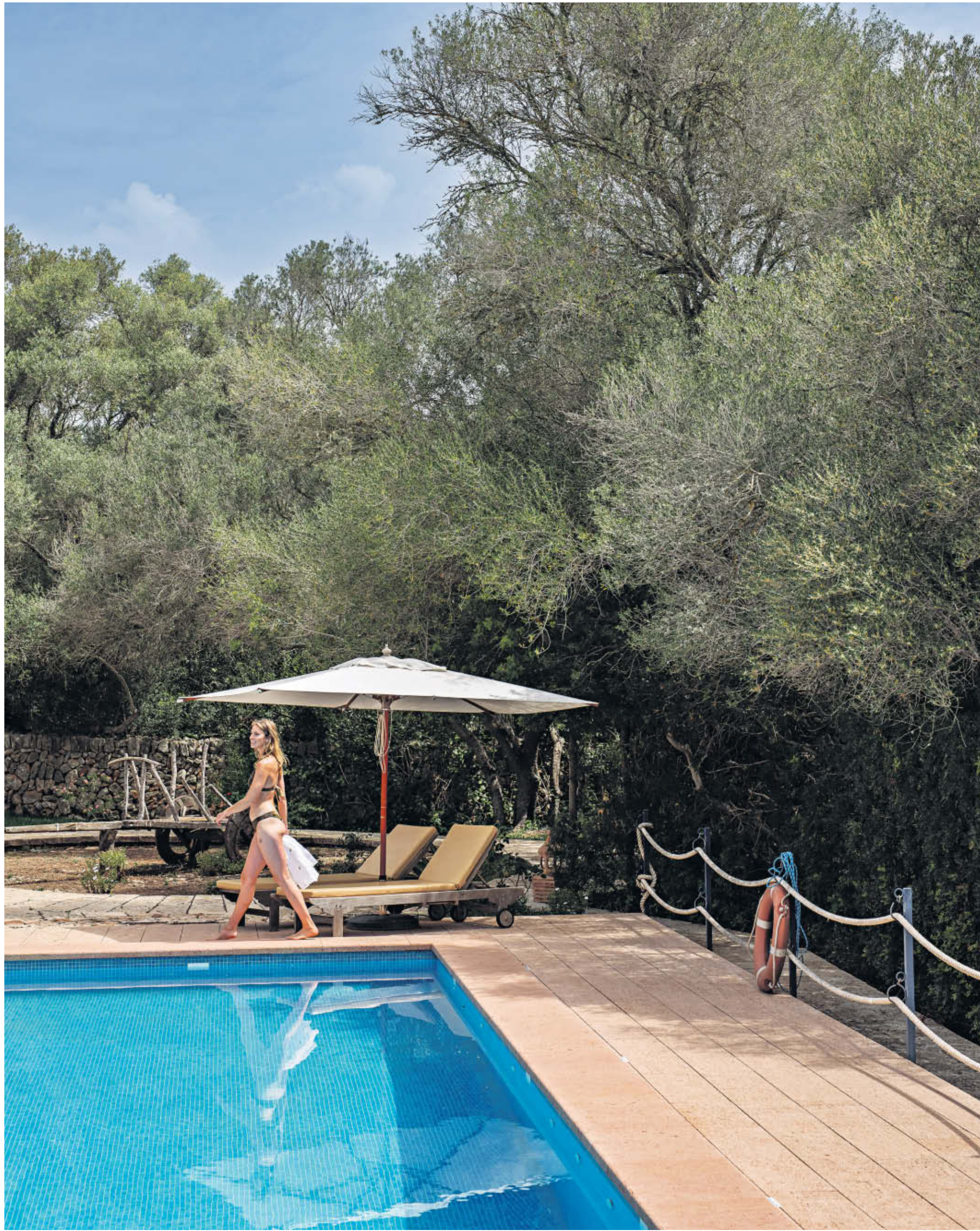
ANALYSIS FOR THE TELEGRAPH: SUE CALISTER