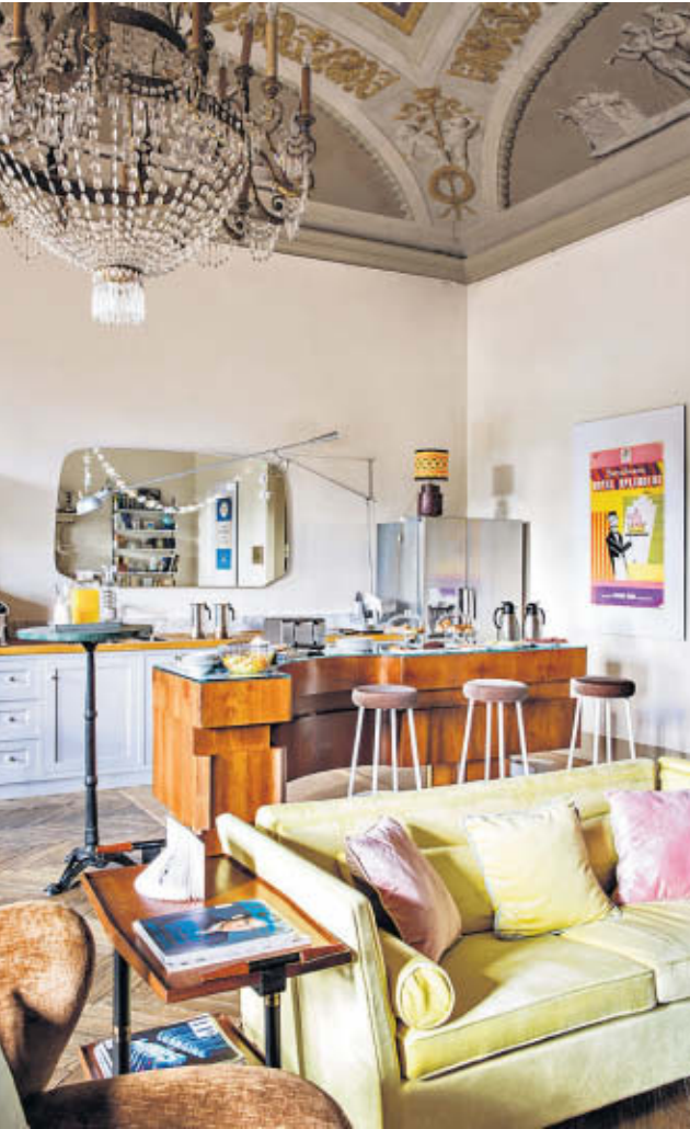
▲ Eclectic: flea market finds meet frescoed ceilings at AdAstra in Florence ▼ Casa Olea on Lake Como

Car-free Panarea is a gem of an island: unspoilt, beautiful, uncrowded – yet