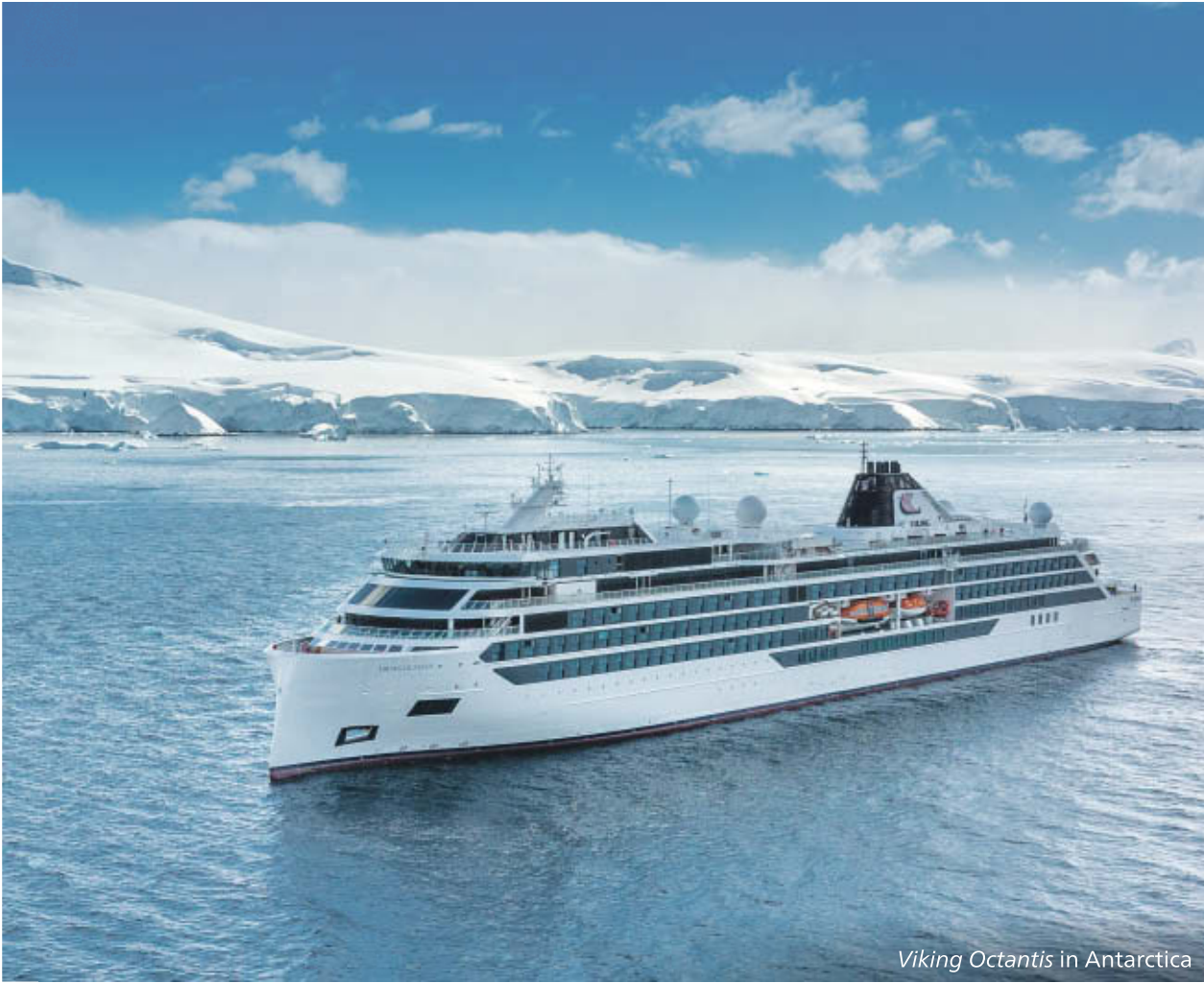
Viking Octantis in Antarctica