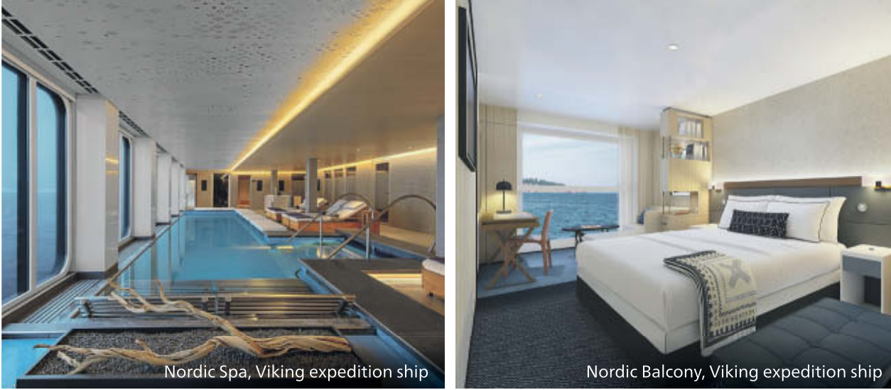
Nordic Spa, Viking expedition ship